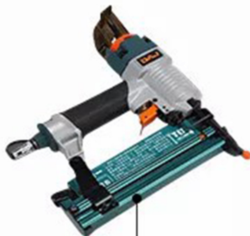
Woodworking nail gun